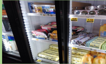
Dairy-eggs, milk, butter, biscuits, etc.