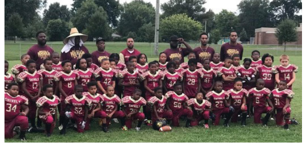
The Mitey Mites 6 years and under finished the season with a 12-3 record and tournament wins. River City Champions, King of the City Champions, Rank Up Louisville Tournament Champions, Raw Talent Turkey Bowl Champions and Rumble in the Jungle Champions.