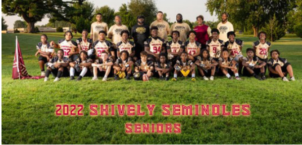
The Seniors finished with a 6-2 season and Louisville Youth Football League Runner Up.

The City of Shively would like to Congratulate the Shively Seminoles Football Teams and Cheerleaders for a Fabulous 2022 season! Thanks to All the coaches, parents, players, supporters and volunteers!