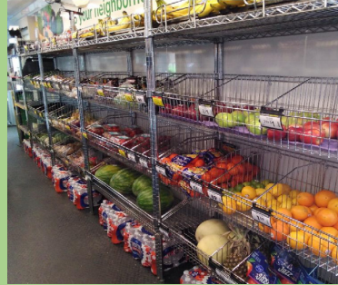
Fresh produce and bottled water