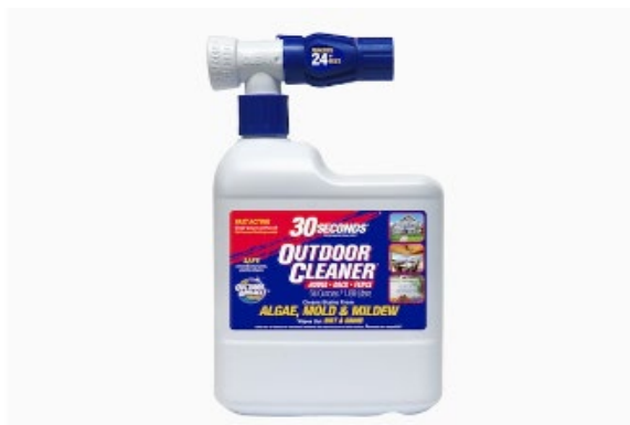
30 SECONDS 64-oz Mold and Mildew Stain Remover Outdoor Cleaner