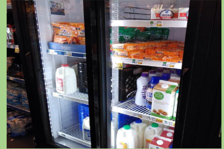
More dairy - cheese (shredded and block), cream cheese, Half & Half, coffee creamer, etc.