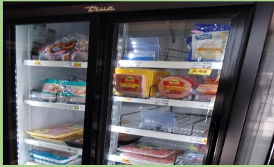
Fresh and packaged meats