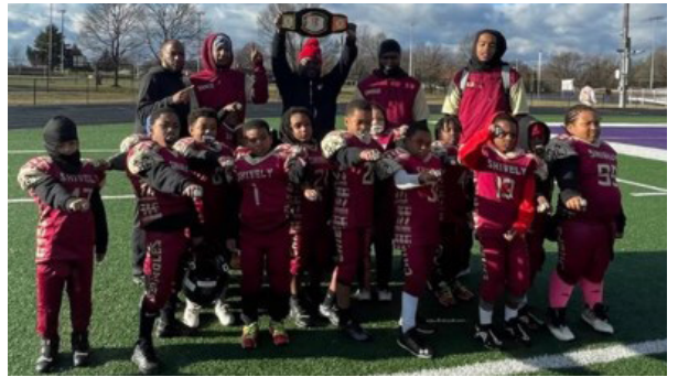
Shout out to the Shively Seminoles Cheer, The Lady Notes!